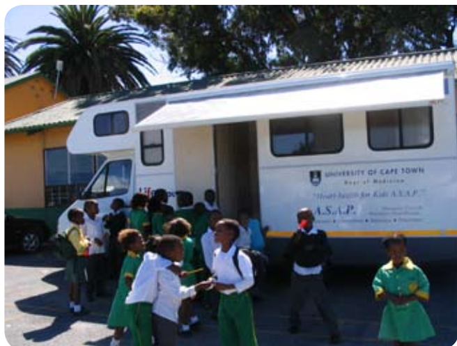
Mobile clinic, Cape Town, South Africa

Applied Research projects are part of the World Heart Federation's efforts to achieve measurable impact on cardiovascular disease risk levels in low- and middle-income countries. They are specifically geared towards demonstrating best practice in cardiovascular disease prevention and control and span several continents.