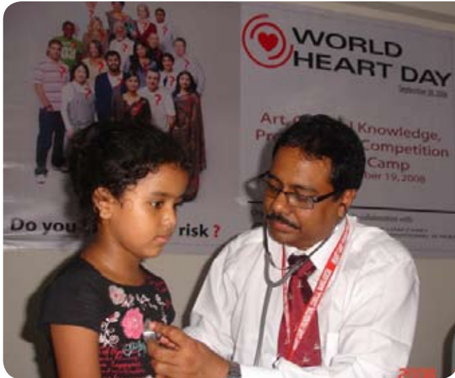
World Heart Day, Bangladesh

Awareness building is one of the World Heart Federation's core activities. By informing people and policy-makers about cardiovascular disease and its prevention, it seeks to encourage world-wide action.