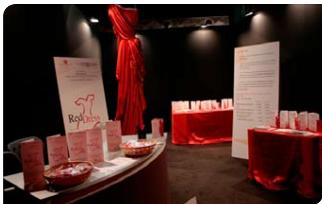
Red Dress, Italy