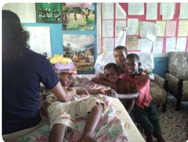
Rheumatic fever screening study, Fiji

was launched early in the year. The forum facilitates discussion on practical challenges and best practice around RHD control. The Brazilian National Institute of Cardiology has translated one of the project databases into Portuguese, and the Brazilian Heart Foundation is translating the training curriculum into Portuguese.