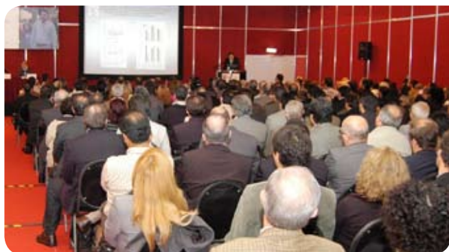
World Congress of Cardiology, Argentina

The World Heart Federation shares science and helps to build capacity for the prevention and management of cardiovascular disease at the global level through its member networks, congresses and workshops. At the same time, it works with its partners to develop consensus on key strategies for reversing the epidemic of cardiovascular disease.