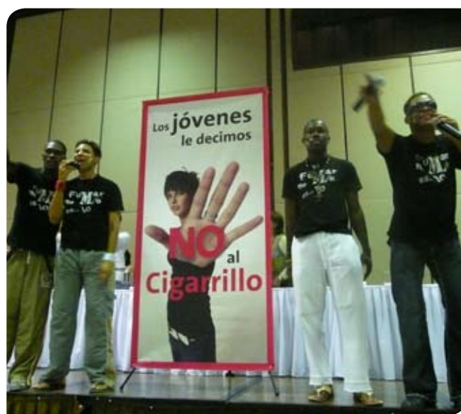
Youth smoke-free advocacy