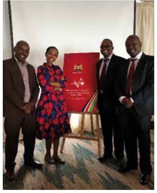
PARTICIPANTS AT THE KENYA ROUNDTABLE

The guidelines build on the MoH's national registers and clinical guidelines on diabetes and CVD, and align with the Ministry's National Strategy on Non-Communicable Diseases (NCDs) 2015.