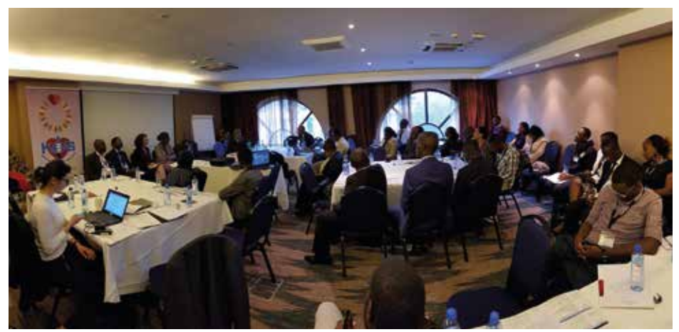
GROUP DISCUSSION DURING THE KENYA ROUNDTABLE

With an estimated 50 cardiologists for 44 million people, the guidelines lay the ground for a climate of task shifting, by outlining the different levels at which community health workers, generalist and specialized nurses, primary care physicians, surgeons, radiologists, anaesthesiologists and other health professionals should intervene and share tasks to prevent, treat and manage cardiovascular diseases.