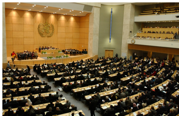
WHF advocated at the 72nd World Health Assembly (WHA) focusing on Universal Health Coverage (UHC).