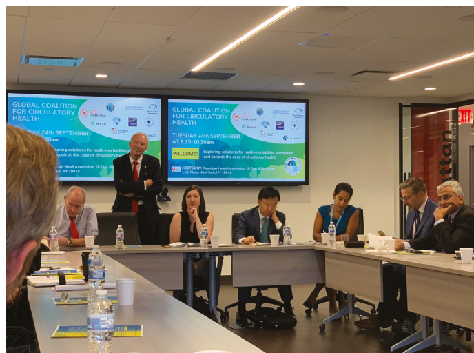
The Global Coalition Members exploring solutions for multi-morbidities at AHA's offices in New York.

At the UN High-Level Meeting on UHC, the Global Coalition member organizations' leadership held a side event under the theme Exploring solutions for multi-morbidities prevention and control: the case of circulatory health in partnership with the American Heart Association (AHA). The event also marked the launch of a Call to Action for Improving Access to Essential Medicines for Cardiovascular Diseases , in the form of a position paper which proposes four key recommendations to national governments to improve and expand access to essential medicines. The Coalition is now working behind the scenes to build on the White Paper for Circulatory Health, which was launched last year at the UN High-level Meeting on NCDs.