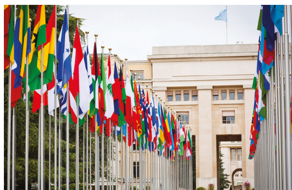
This year, WHF continued working with the UN to bring attention to the CVD agenda.