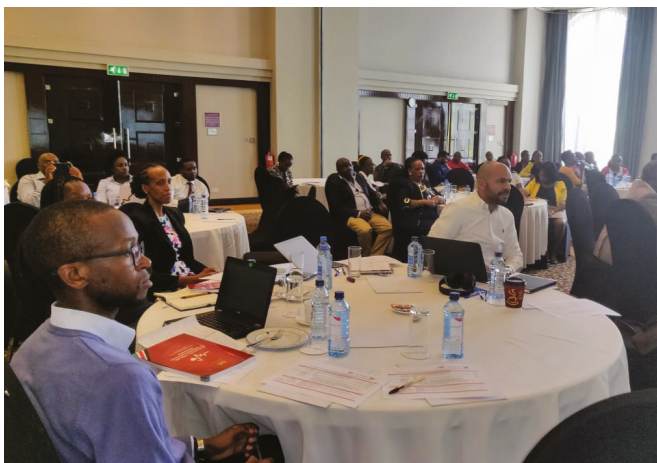
Stakeholders discuss the CVD Guidelines' implementation at a national meeting in Nairobi, Kenya.

On 14 March, a national meeting brought together in Nairobi more than 60 national stakeholders to discuss the right monitoring approach to track success of the dissemination. The meeting was followed by a 'Train the Trainers' Workshop in June, which convened 25 participants from five different counties to unpack the CVD guidelines. After these successful discussions, the KCS kickstarted the country-level dissemination workshops between 16 September and 31 October. The project aims to reach 2,000 health professionals and 100 health facilities , and thus improve the treatment and management of CVD for an estimated 10,000 people living with CVD.