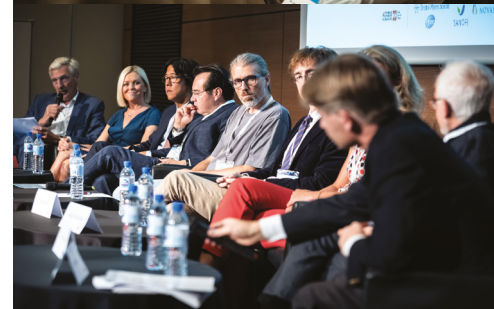
Experts and stakeholders reunited at the 4th Global Summit in Circulatory Care.

Did you miss the Summit? Watch a summary here!