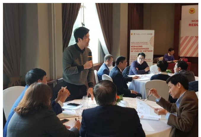
WHF's Hypertension Roundtable held in Hanoi, Vietnam.