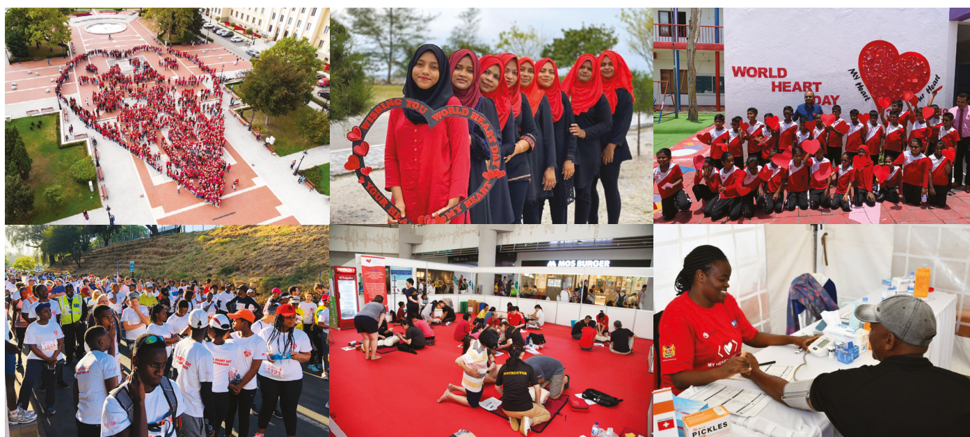
World Heart Day celebrations around the world.