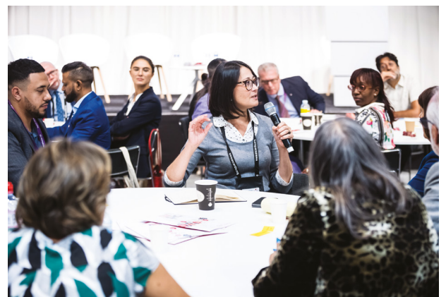
Discussing CVD challenges at the 2nd Meet & Share Forum in Paris.

This was an exciting opportunity for foundation representatives across all continents to bring to the agenda their own understandings and use this forum as a stage to showcase successes and challenges. The Meet & Share Forum at ACC.20/WCC will take place on 28-30 March 2020 and will also be built around interactive panel discussions with expert representatives from each global region.